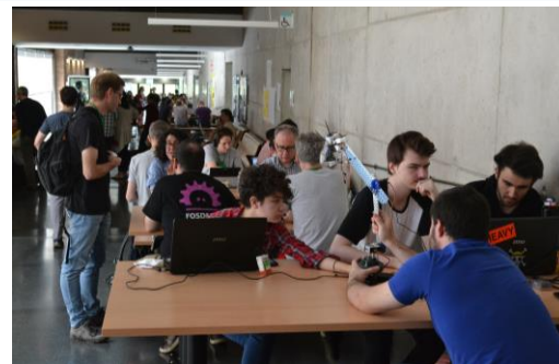
Unuaiga, Wikimedia Hackathon Barcelona 2018 (04), CC BY-SA 4.0