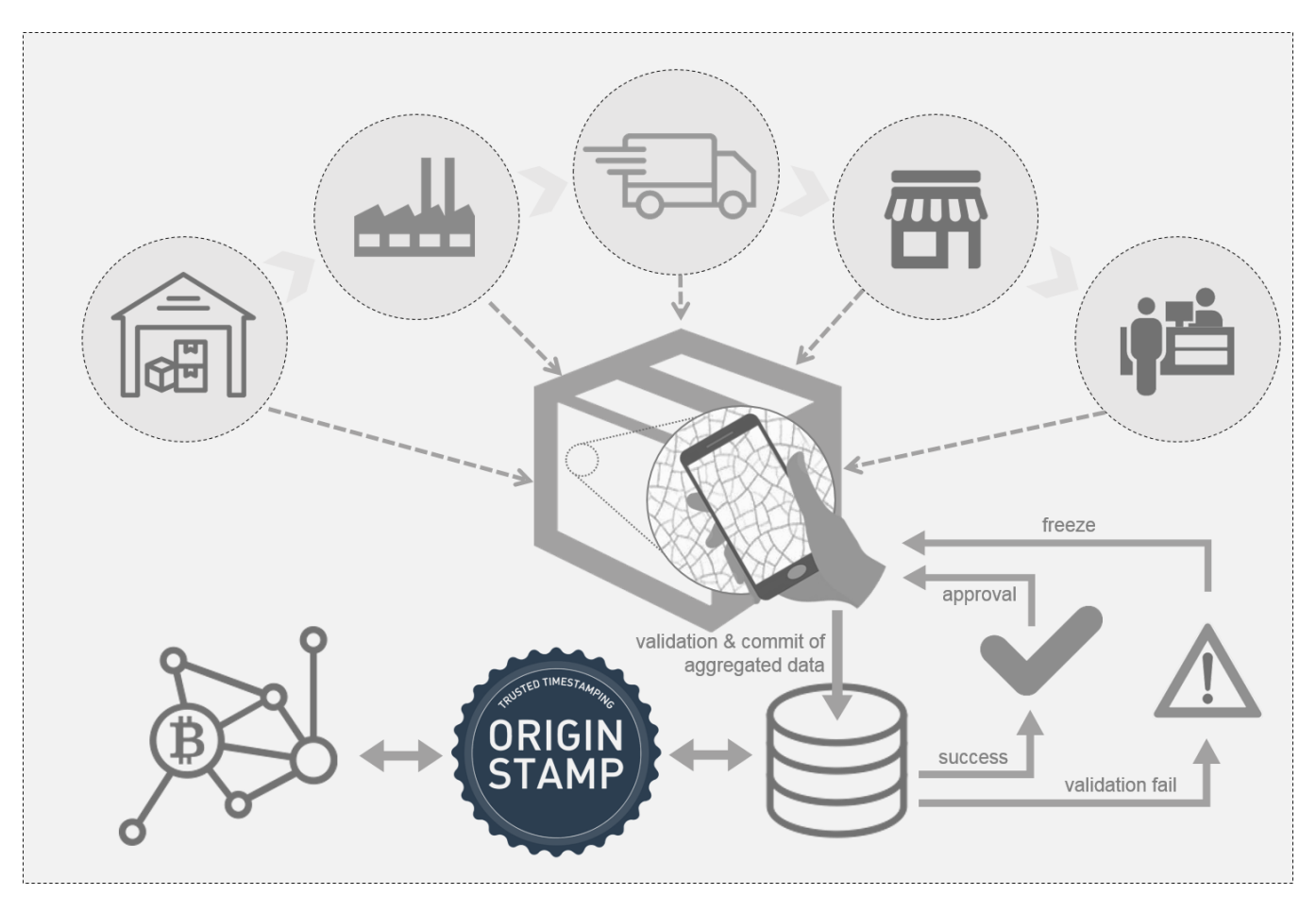
Figure 2: The figure illustrates the process of tracking a physical asset with a mobile phone camera. Each time the craquelure is scanned and verified, the corresponding meta-data, i.e. perceptual hash, location, or temperature, is encrypted, hashed, appended and finally timestamped with OriginStamp.

of manipulation, censorship or hardware failure, the blockchain will not be affected, because every node stores all information resulting in high redundancy. [22] In addition to storing data in the decentralized blockchain, data can be also managed by centralized approaches, which are introduced in the following sections.