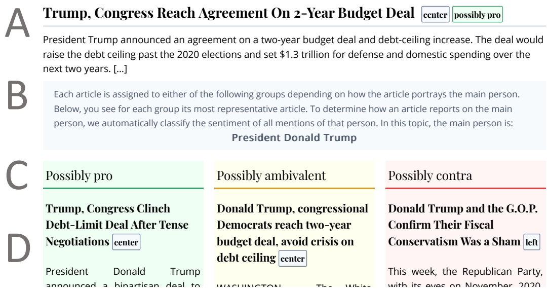
Figure 1: Excerpt of the MFAP overview showing three primary frames present in news coverage on a debt-ceiling event.

content, the visualizations show texts of articles (and information about biases in the texts) but no other content, e.g., photos and outlet name.