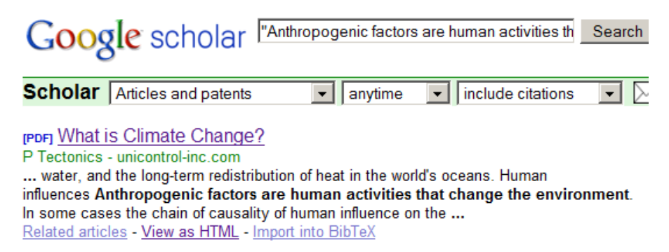
Figure 9: Indexed Wikipedia article from third party website

indexed this PDF (see Figure ) and counted its references.