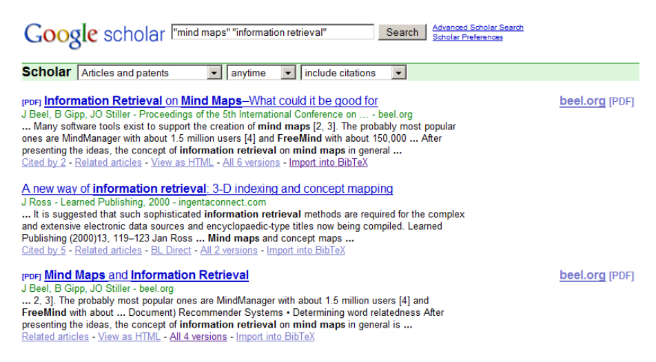
Figure 7: Duplicates with identical content but different title are listed as separate search results

That means when users of Google Scholar search for 'mind maps' and 'information retrieval' the result set displays not only the original article, but the modified one as well (see Figure ). Accordingly, the probability that users will read the article increases.